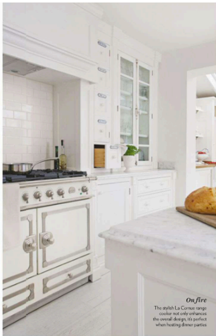
On fire The stylish La Cornue range cooker not only enhances the overall design, it's perfect when hosting dinner parties