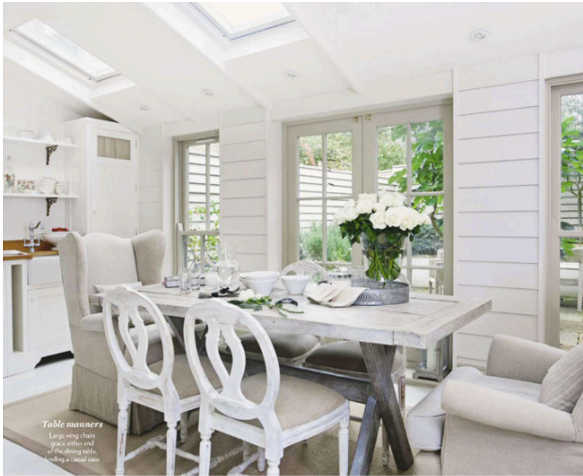
Table manners Larger seating takes up the end of the dining table, making a casual use